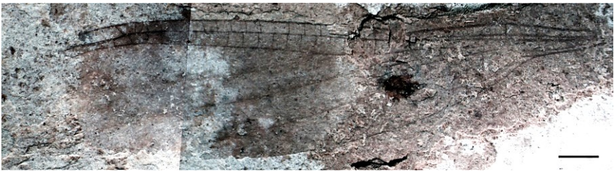
Figure 1. Photograph of Nelala chacay sp. nov. Holotype BAR 8750 from Arroyo Chacay (Río Negro, Argentina). Eocene. Species habitus. Scale bar = 2 mm.