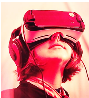
Figure 1. Woman wearing head mounted display that utilizes a phone for 360° video.

Immersive technologies have been available for classroom use for several years. But, despite this, it is still very much an emerging field. With recent more user-friendly and cost-effective developments, these technologies are quickly becoming broadly adopted in educational settings. As with the integration of any new educational technology, careful thought and planning should be used to choose the right tool for the right instructional goal. Once this happens, then best practices should be employed to develop meaningful activities that align with course goals. Immersive technologies provide a way to enhance the student learning experience like never before, and while it may feel quite complex to think about integrating these experiences into instruction, the learning payoff can make it a very worthwhile effort. Figure 1 shows an example of what one type of immersive experience hardware looks like and utilizes a phone in a headset viewer.