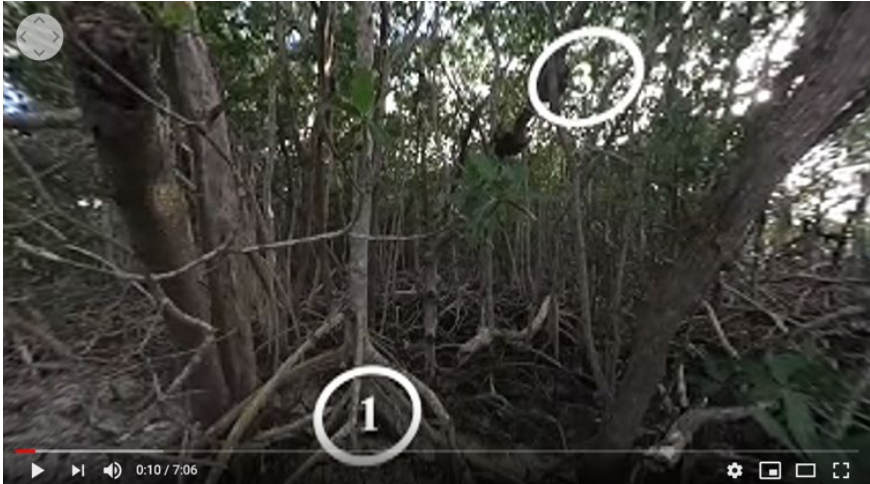
Figure 8. Augmentation Example - 360° video of mangrove biome with audio and visual guidance of points of interest. This paired with a corresponding handout for more information and an associated activity to hold students accountable. The video is available through a Creative Commons license 4.0.