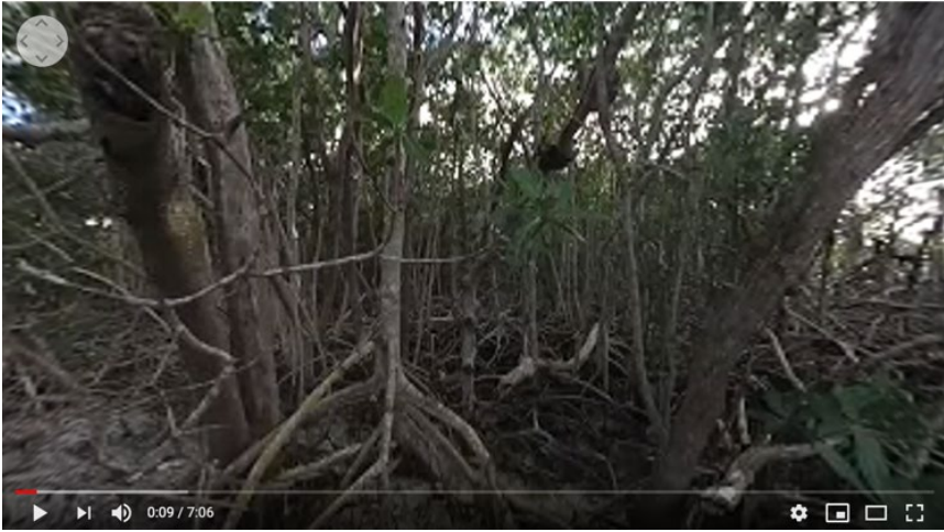
Figure 7. Substitution Example: 360° video of mangrove biome with audio, but without any narration, guidance, or points of interest.

The following is an example of how an activity using 360° video can fulfill all four levels of the SAMR Model in which the video allows viewers to explore a mangrove biome as seen in Figure 7.