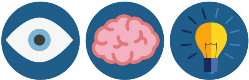
Figure 10. See, Think, Wonder represented by eyes, brain, and lightbulb. Graphic created by Amy Kuntz.