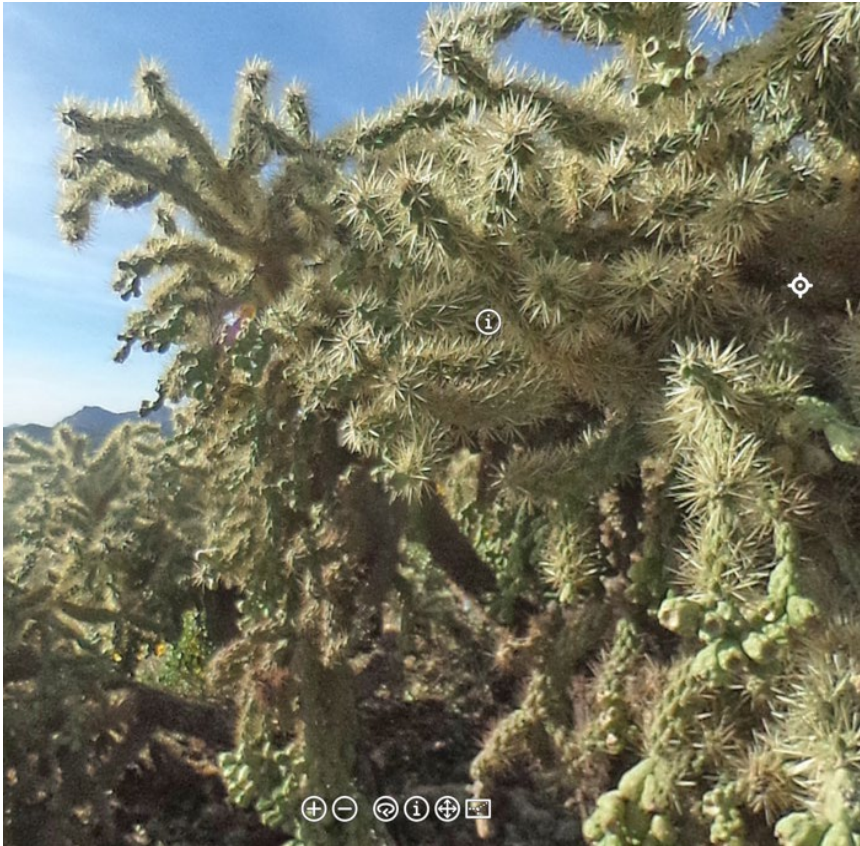
Figure 2. Photo from Desert Biome VR 360. Desert Biome VR 360 images were taken by C. J. Kazilek and they are available through a Creative Commons license. Location: Lost Dutchman State Park, Sonoran Desert east of Picacho, South Mountain Park, Arizona, USA (August 24, 2016).

screen (for computer use). The clickable information embedded on the image is designated with an “i”, and when clicked, provides information about particular areas on the image. Other target icons do things like enable viewers to move to additional 360° images within the same biome.