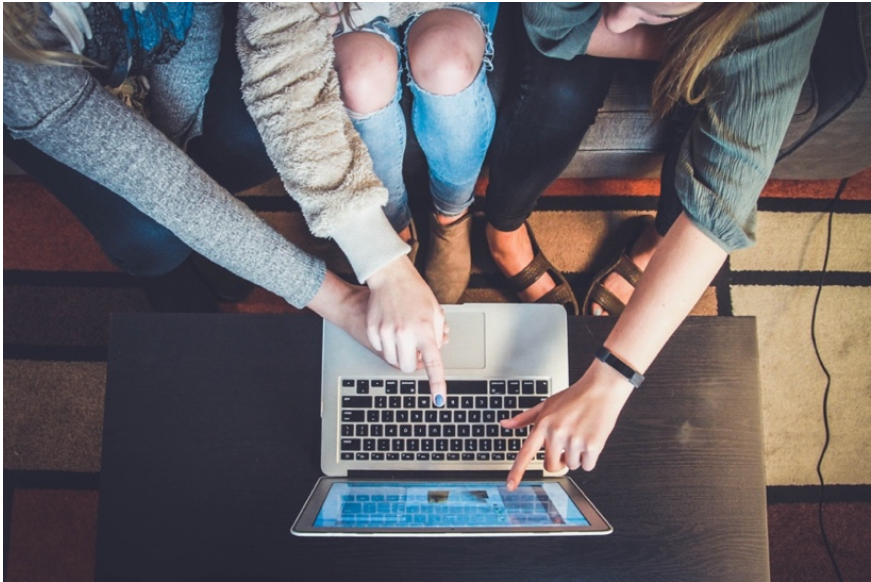
Figure 9. Small group of three students navigating the computer of a 360° video via an Internet browser.

When creating your lesson plan, utilize your pedagogical expertise in your discipline as a way to utilize the immersive experience as an entire activity toward meaningful educational goals. Due to the ability to navigate many immersive experiences in non-linear fashion, 360°perspective, or both, make sure you decide how you want to guide students, or let them explore in the way they choose, and plan accordingly. In addition, be sure to clearly articulate the purpose of the use of immersive experience to the students and how it will help them achieve the stated learning outcomes.