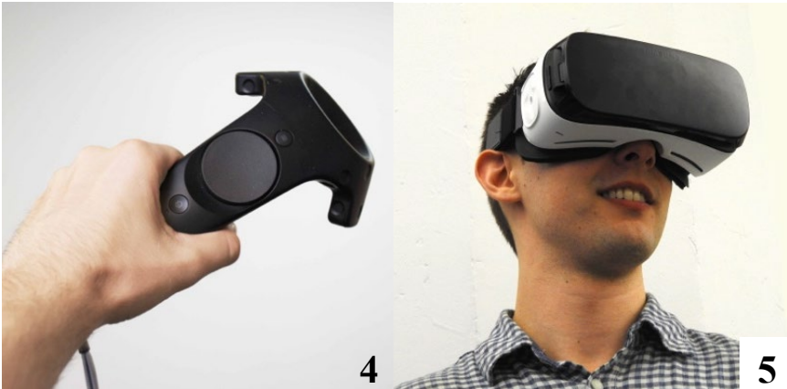
Figures 4 and 5. 4. HTC Vive controller used to navigate virtual reality experiences. This photo was taken by Jesper Aggergaard , was posted on Unsplash , and it is available through a Creative Commons license. 5. Man wearing Samsung Gear head mounted display. This photo was taken by Hammer and Tusk and it was posted on Unsplash . Both images are available through a Creative Commons license.

These questions and examples may help guide the type of immersive experience selected to achieve a particular instructional goal. Another tool that can be useful in the design process is the SAMR Model, described in the next section.